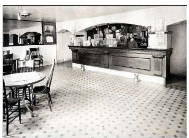
Ernie Moritz's bar in the basement of the Monticello House Hotel. It was commonly known, at least by some of the local wives, as "The Hole."

-Monticello Messenger, December 19, 1935