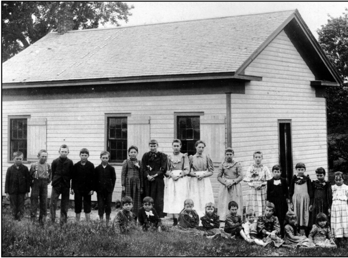
Recollections, cont. ...