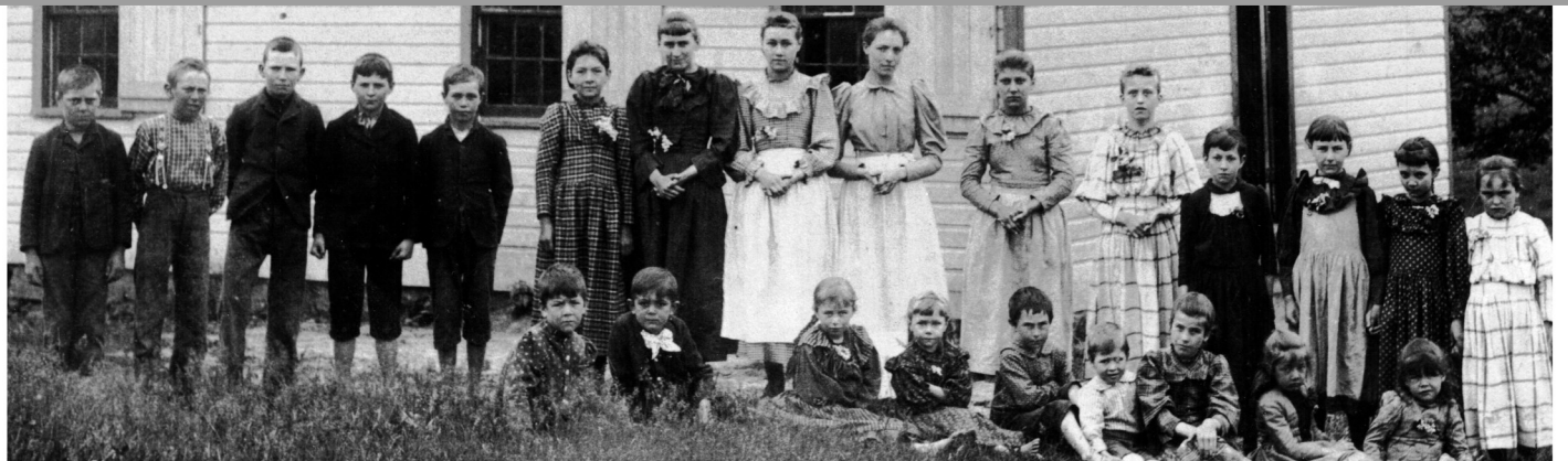
Loveland School 1888-1890 ?

By 1874, grammar was on the list of text books, but only the very advanced pupils studied grammar. The county superinten-