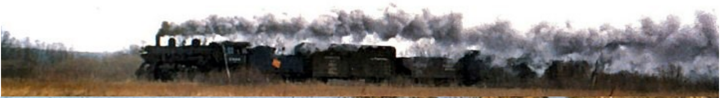
The Milwaukee Road's "Limburger Special" carried cheese on the short line between Brodhead and the New Glarus Terminus.