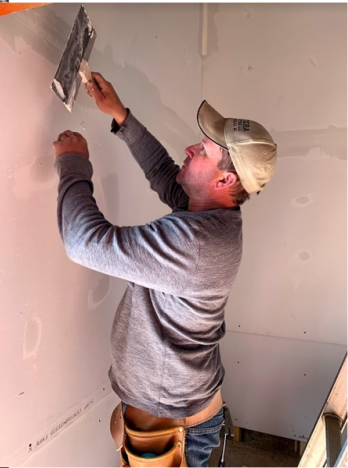
Plastering shaft of elevator.