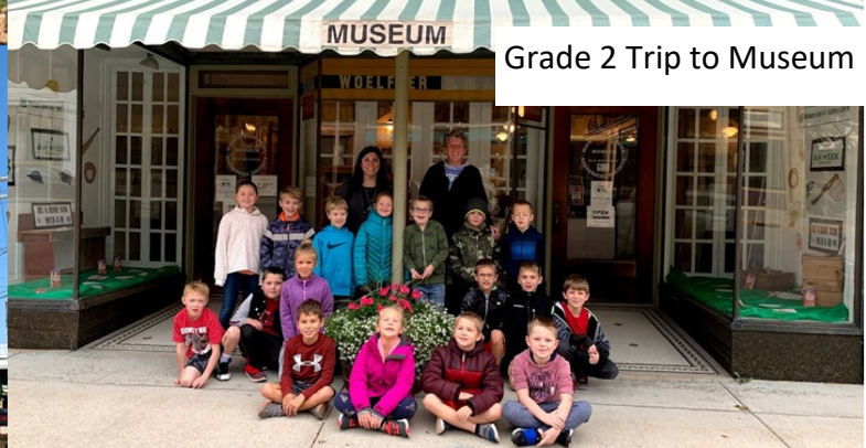
Grade 2 Trip to Museum