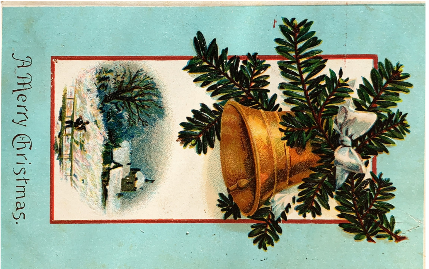
Christmas postcard from 1920 sent here in Monticello