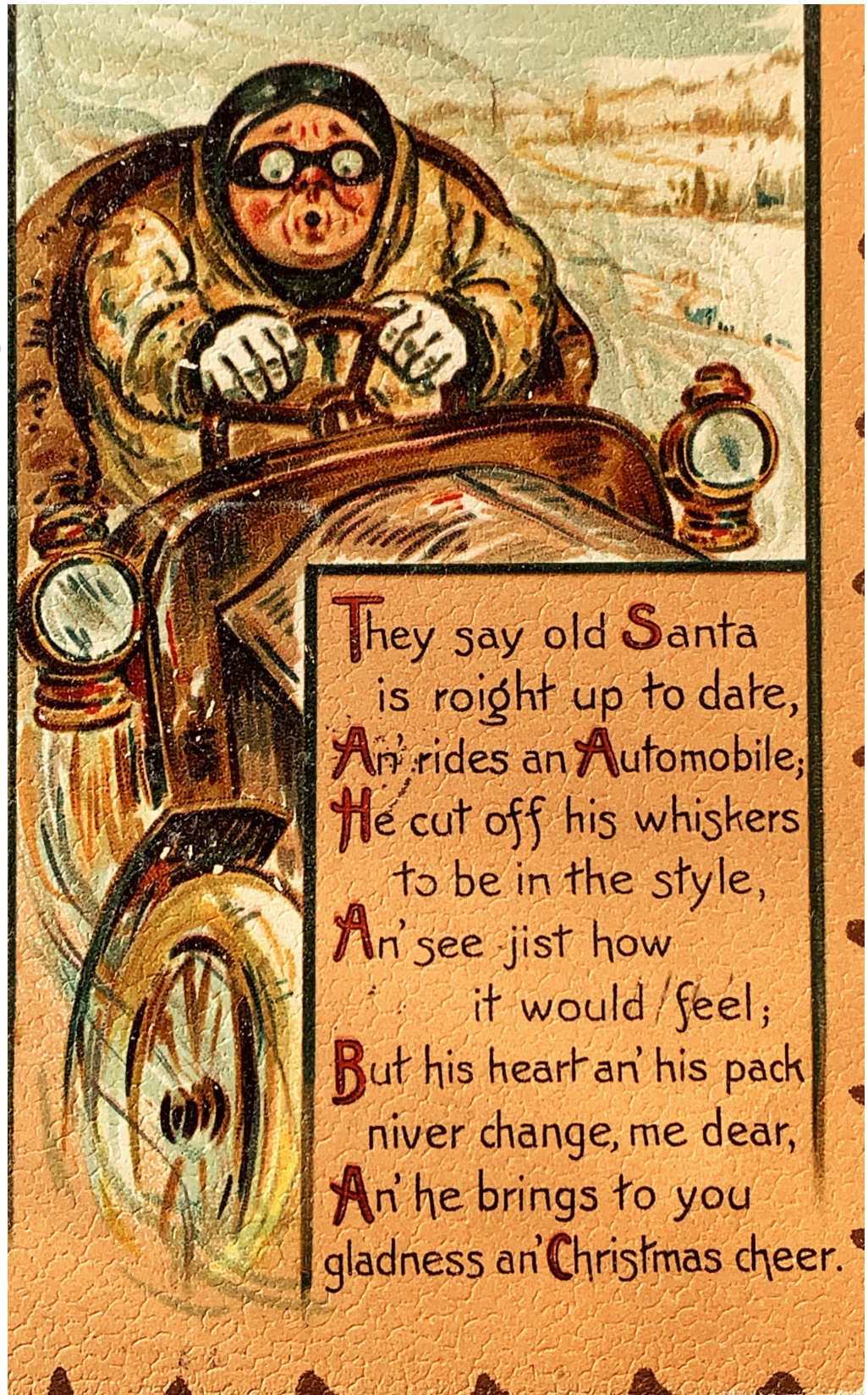
Christmas Postcard 1913

Enthusiastic crowds are expected to attend this event. The sensational bargain event of the season will take place Friday and Saturday November 20-21 when the businessmen join hands in sponsoring two big Dollar Days. Extensive plans are being made to make this big two-day event one of the greatest in the town's history. This big price slashing event comes as a pre-holiday sale and follows on the heels of a similar affair held last month when Monticello streets were virtually humming with enthusiastic shoppers. At this time residents of the Monticello territory will have a golden opportunity of making purchases at remarkably low prices that will mean substantial savings. Nothing can be spared to bring people to Monticello in large droves for Dollar Days. With the attractive bargains which will be offered by the local stores shoppers have more than one reason for doing their buying here in Monticello. With Christmas only six weeks away it might be well worth your time to investigate these tempting offers. It's never too early to be thinking about Christmas gifts. Dishes, pans, gloves and all sorts of quality merchandise will be on sale all at substantial bargains. Moreover, all the merchandise offered by the merchants on Dollar Days is of the highest quality, No inferior goods bought especially for this sale.