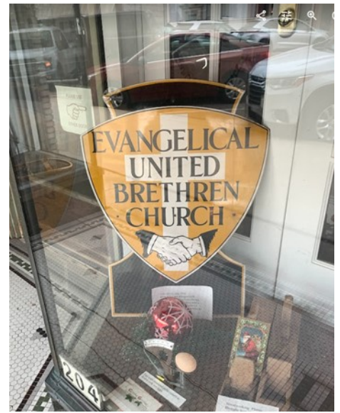
Currently in our window display. Notice the name change from the ad run 100 years ago—1923.