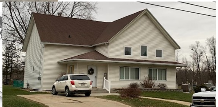
Built in 1894 as an Adventist Christian Church building, it was later purchased and enlarged by the Grace Evangelical United Brethren church congregation. In the 1970's the church was made into an office / clinic for Freitag Chiropractic. Then to an office for Mt. Pleasant Perry Mutual Insurance. Now in 2023 converted to a home.